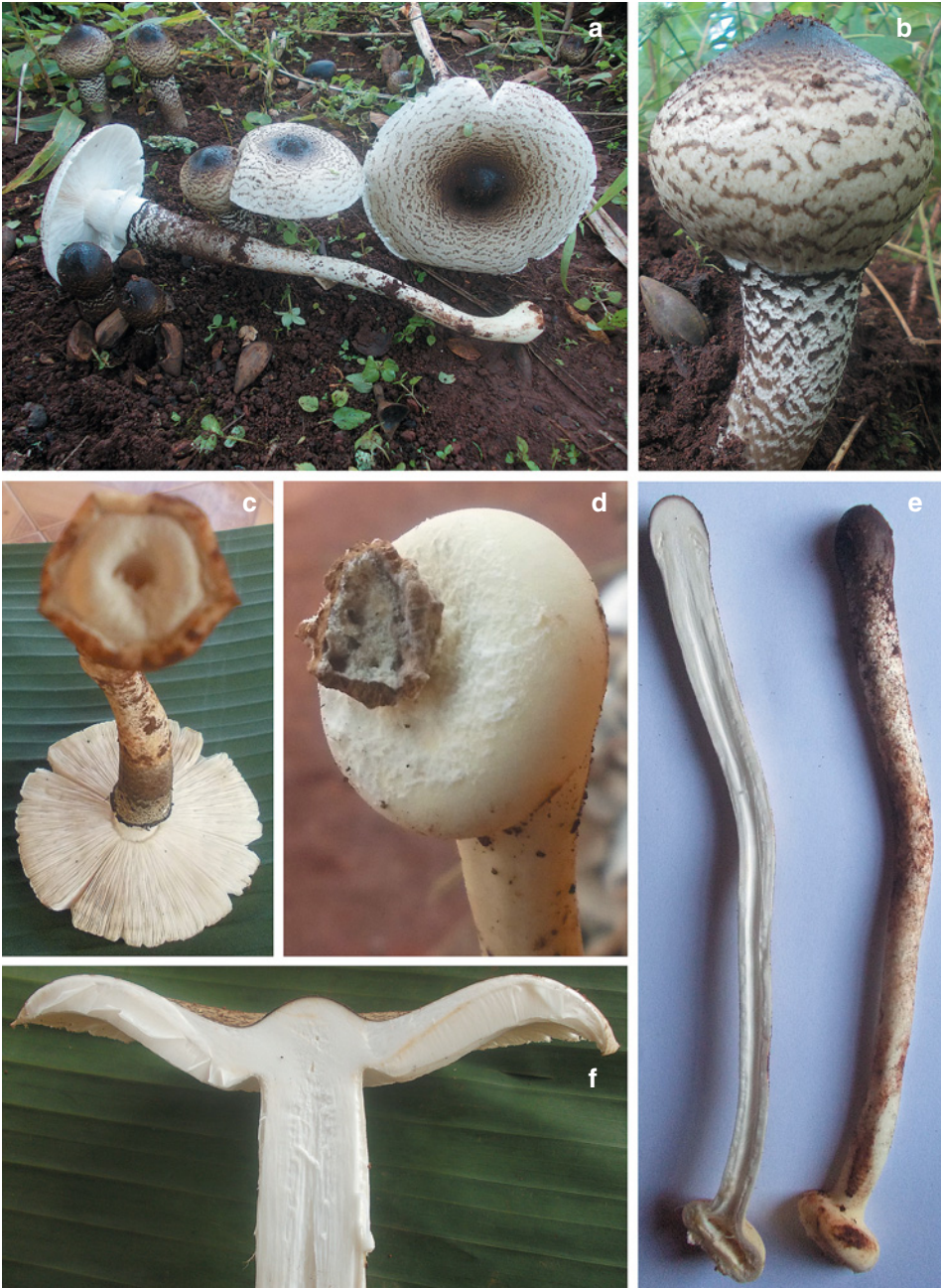
Fig. 1. Termitomyces reticulatus (BR0000020500580), macroscopic features: a – basidiomes of various ages in the field; b – young basidiome; c – end of pseudorhiza, disc opened; d – end of pseudorhiza, disc closed; e – very young basidiome in longitudinal section; f – longitudinal section of mature basidiome.