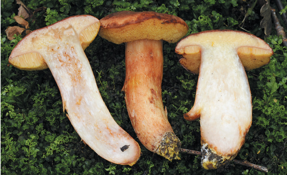
Fig. 11. Xerocomus silwoodensis , lake Donbas, Tovačov, Moravia, Czech Republic, 23 Aug. 2013, under Populus , leg. J. Polčák & M. Graca (PRM 924312).