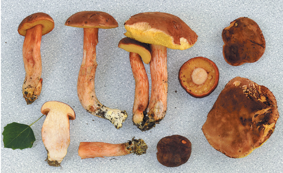
Fig. 3. Xerocomus silwoodensis , lake Donbas, Tovačov, Moravia, Czech Republic, 23 Aug. 2013, under Populus , leg. J. Polčák & M. Graca (PRM 924312).