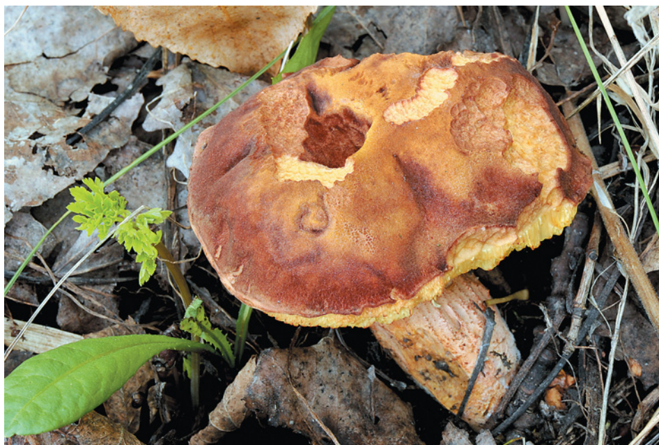
Fig. 9. Xerocomus silwoodensis , lake Donbas, Tovačov, Moravia, Czech Republic, 23 Aug. 2013, under Populus , leg. J. Polčák & M. Graca (PRM 924312).