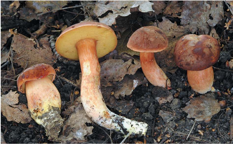
Fig. 2. Xerocomus silwoodensis , lake Donbas, Tovačov, Moravia, Czech Republic, 23 Aug. 2013, under Populus , leg. J. Polčák & M. Graca (PRM 924312).