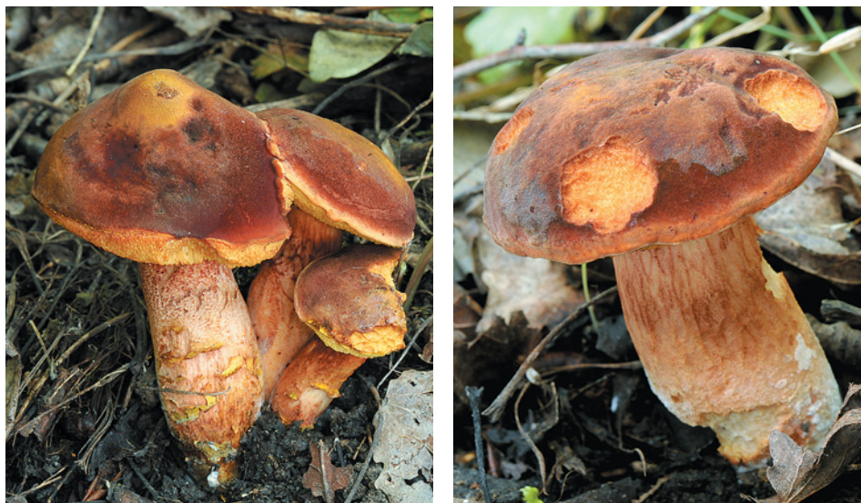
Fig. 7 (left), 8 (right). Xerocomus silwoodensis , lake Donbas, Tovačov, Moravia, Czech Republic, 23 Aug. 2013, under Populus , leg. J. Polčák & M. Graca (PRM 924312).