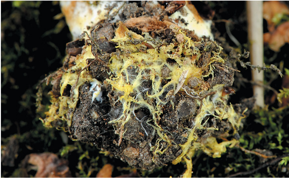
Fig. 4. Xerocomus silwoodensis , lake Donbas, Tovačov, Moravia, Czech Republic, 23 Aug. 2013, under Populus , leg. J. Polčák & M. Graca (PRM 924312).