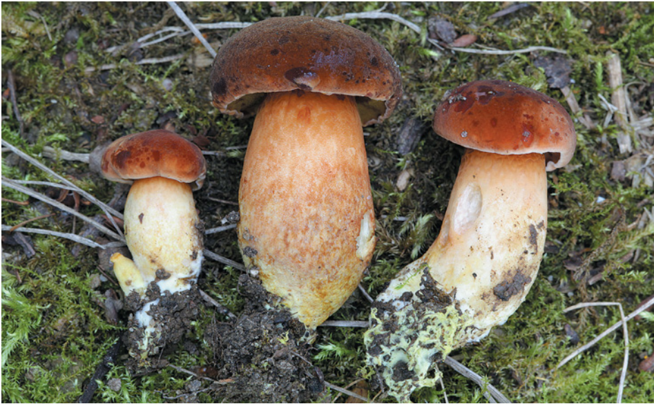
Fig. 10. Xerocomus silwoodensis , lake Donbas, Tovačov, Moravia, Czech Republic, 31 Aug. 2013, under Populus , leg. M. Graca, V. Balner & M. Kříž (PRM 924314).