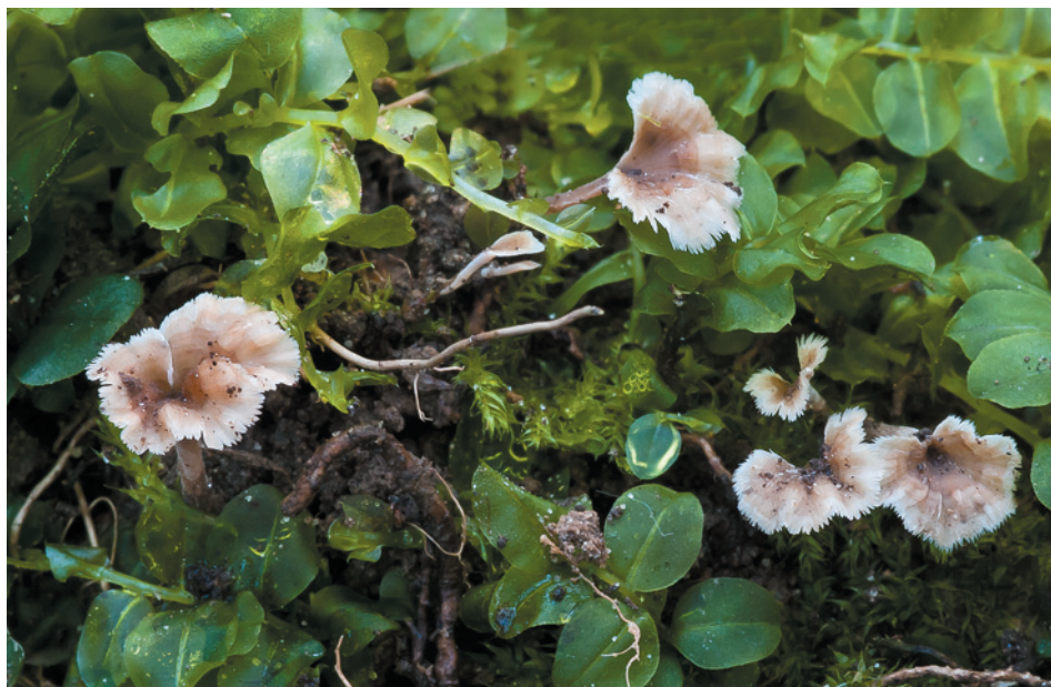
Fig. 1. Basidiomata of Cotylidia muscigena . Czech Republic, Milovická stráň Nature Reserve, 22 Oct. 2011 (PRM 899349).