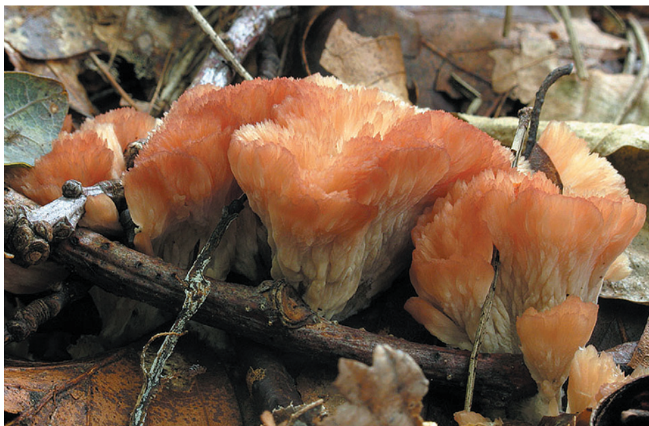
Fig. 2. Basidiomata of Cotylidia pannosa . Czech Republic, Zlín, about 2 km NE of the town, Štákovy paseky, 11 Sep. 2010 (PRM 860825).