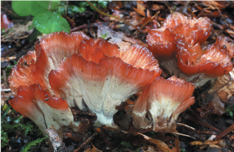
Fig. 3. Basidiomata of Cotyldia pannosa . Czech Republic, Libochovka Nature Reserve, 30 Aug. 2010 (CB).