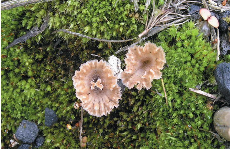
Fig. 4. Basidiomata of Cotyldia undulata . Czech Republic, fly ash deposit approx. 1 km N of Stará Chodovská, 30 Sep. 2009 (CB 16304).