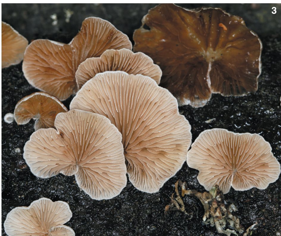
Figs. 2–3. Crepidotus kubickae : juvenile (Fig. 2) and adult (Fig. 3) basidiocarps from the Fabova hoľa Nature Reserve (Veporské vrchy Mts., Slovakia), 7 July 2009 (SLO 710).